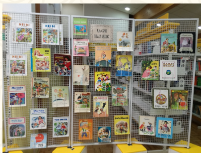
What we once read - an exhibition in our library