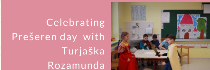
Celebrating Prešeren day with Turjaška Rozamunda