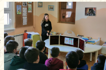
Author's fairy tale and kamishibai