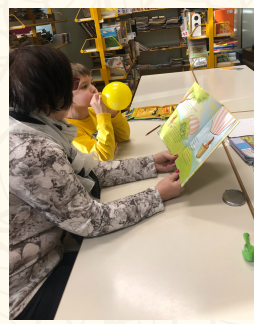
Speech therapy exercises with the help of a fairy tale