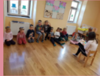
Reading together in Sladka Gora - a fairy tale "Maček Muri" ("Muri the Cat")