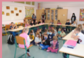
A month of reading together