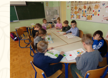
Morning reading in Mestinje