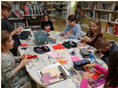
Writing letters to our partner schools