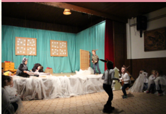
A fairy tale "Mojca Pokrajculja" - dramatization in Zibika