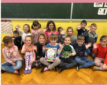
Reading together in Šentvid - a fairy tale "A cauliflower is coming"