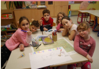
Around Slovenia with a fairy tale - branch school Sveti Štefan